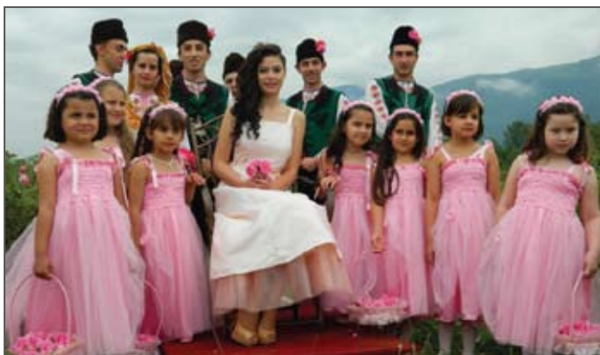
Official Opening of Rose-Picking and Rose-Boiling, Karlovo Municipality