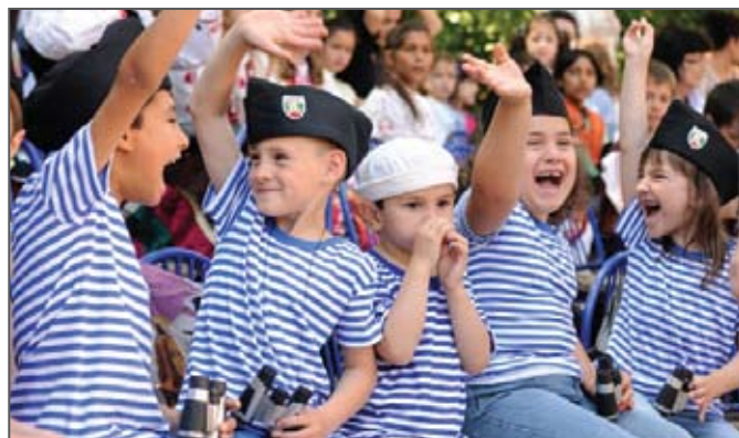
"Sozopolis" Festival, Sozopol Municipality