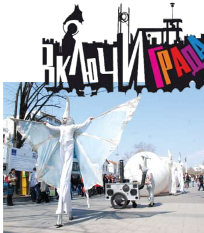
"Include the City" Festival, Burgas Municipality