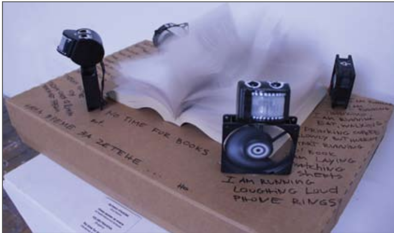
"Digital Art Alternatives" City Multimedia Festival, Varna Municipality

The conception of innovative cultural event does not include the possibility that a similar event has been implemented already in Bulgaria, the region, EU, or somewhere around the world, but the essential in this case is that the event has developed on specific local cultural soil and breeds new life into local traditions, as it even goes beyond them; addresses local needs, local spirit (“cultural ecology” of the location) and leads to creating a “cultural trade mark” of the target territory.