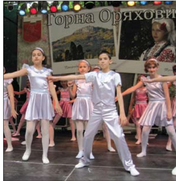
"Bridges to the Future", Gorna Oryahovitsa Municipality