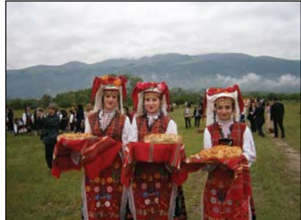
Official Opening of Rose-Picking and Rose-Boiling, Karlovo Municipality