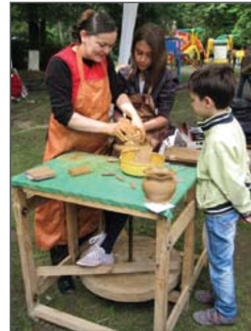
"Bridges to the Future", Gorna Oryahovitsa Municipality