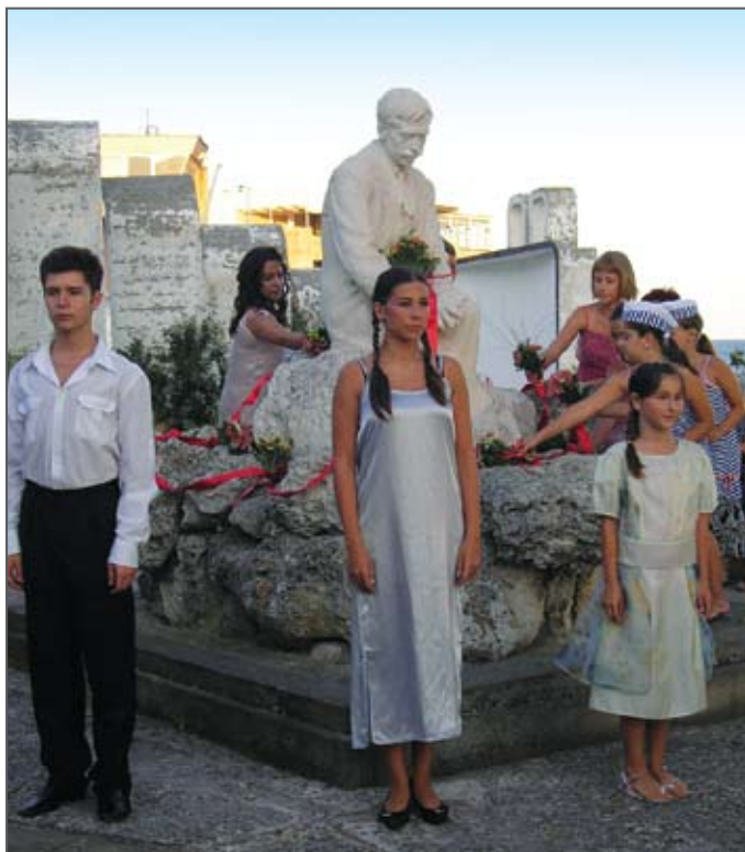
"Palette of the Arts" Festival, Pomorie Municipality