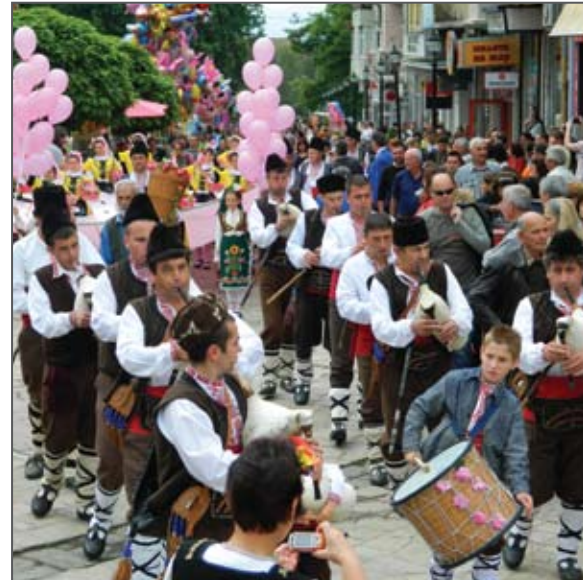
Official Opening of Rose-Picking and Rose-Boiling, Karlovo Municipality